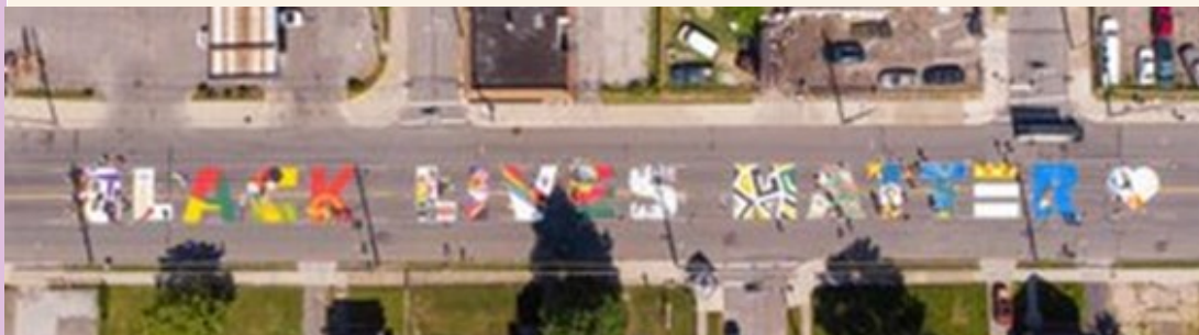
Blacks Lives Matter mural on E. 93 rd Street in Cleveland, blocks from FCUCU Branch

FCUCU, one of the largest minority-owned financial institution in the state of Ohio, is committed to fighting against systemic racism, for racial equality, financial inclusion and independence for the communities it serves.